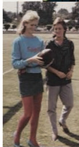
I Swear #1 SONG SUMMER 1994 ALL-4-ONE