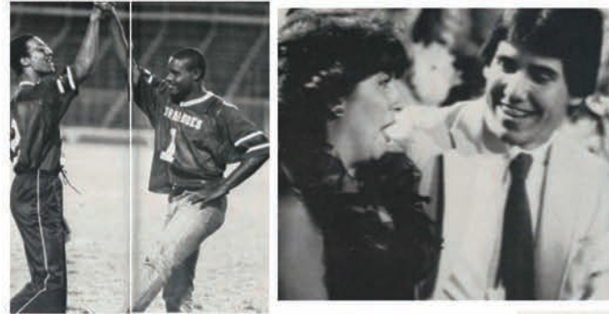
Let's Hear it for the Boys #1 SONG SUMMER 1984 CYNDI LAUPER