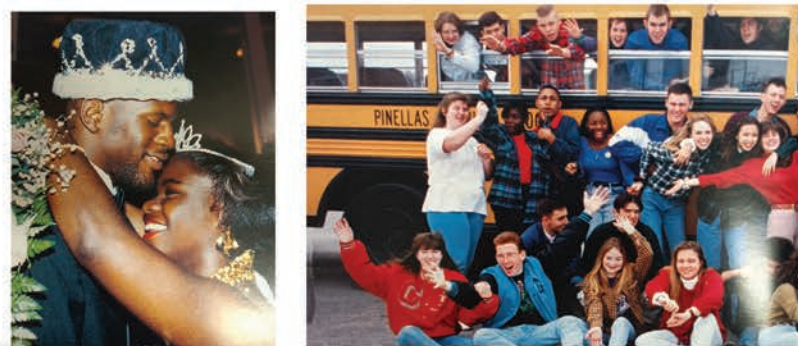
The Lion King #1 MOVIE SUMMER 1994