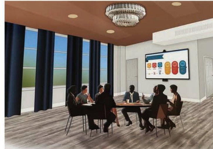
Event Room #1 above, Event Room #2 top right, and the proposed elevator linking the museum and high school below