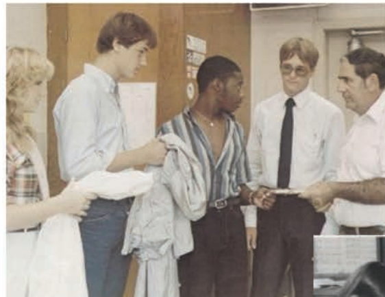
Ghostbusters #1 MOVIE ALL SUMMER 1984