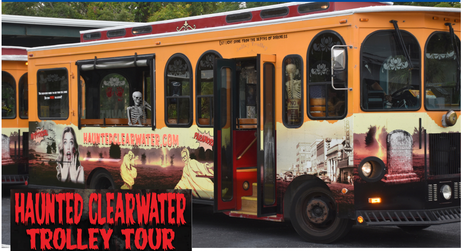
Jolley Trolley decked out for Haunted Tour