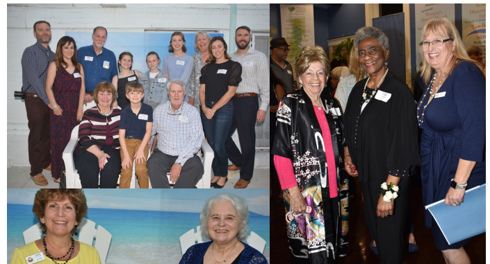
Trailblazing Women 2022 and their families come together to celebrate National Women's History Month