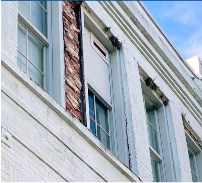
South side of the 1912 High School Building