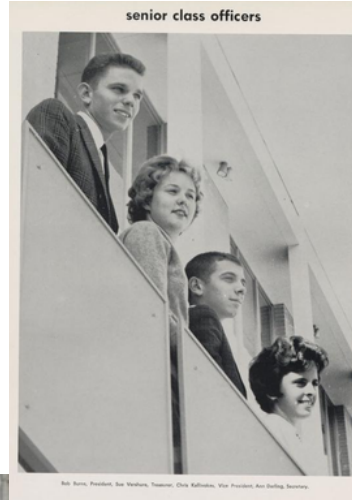
senior class officers