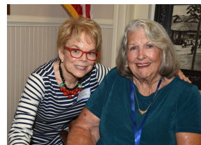
Volunteers in action