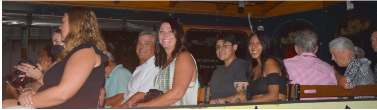
Opening night for the Haunted Clearwater Jolley Trolley Tour. Local hotel concierge group members got to be first to ride.